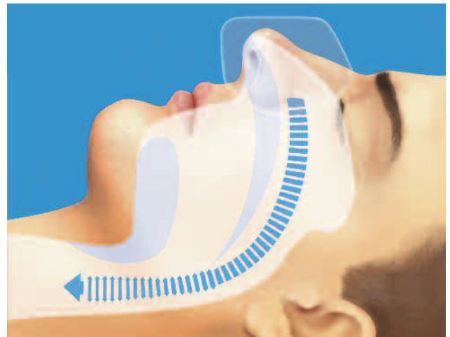
Positive airway pressure therapy